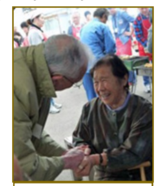
The gift of a smile

The tsunami claimed 19,000 lives and those who survived have suffered greatly. Many survivors are